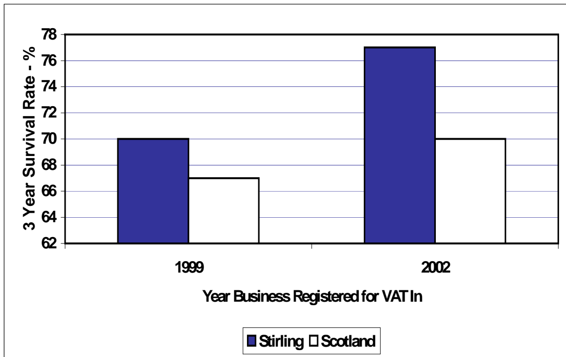
Figure 2: Three-Year Business Survival Rates – VAT Registered Enterprises